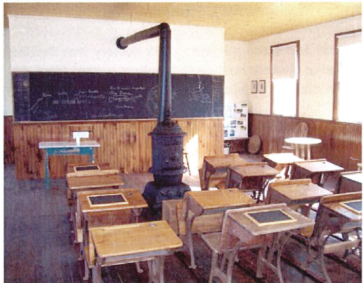
Interior of the newly renovated Hoover School