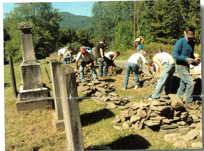
Elkdale Cemetery Stone Wall Repair Project