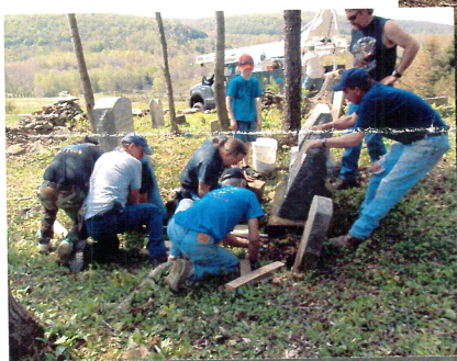
Volunteers work to reset toppled gravestones.