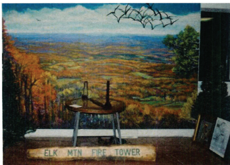
Painted by Michelle Jaconia McLain

The museum exhibit of our treasured Elk Mountain fire tower map has been complimented by a colorful mural of the westerly view that would have been seen from atop Elk Mountain during the fall fire season by the wardens stationed in the fire tower.