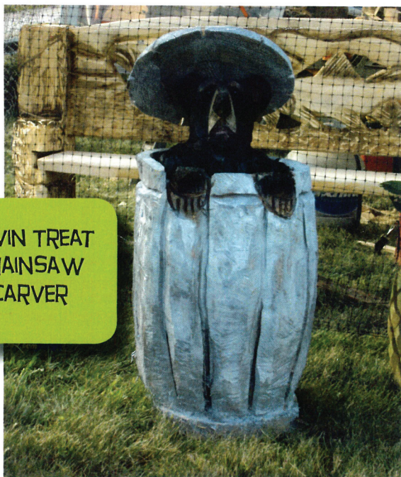
KEVIN TREAT CHAINSAW CARVER

We are looking for old Clifford Elementary School class pictures or pictures of teachers to display in the hallway of the Community Center. If you have photos you would like to share, please contact Sandra Wilmot at 570-679-2723 or Pat Peltz at (peltz@nep.net).