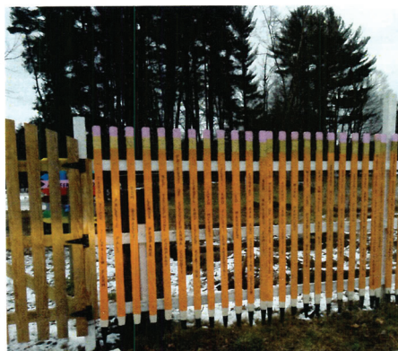
Each slat of the pencil fence is inscribed with a donor's name.