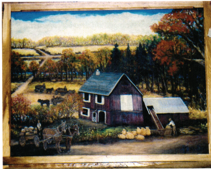
Old Yarns Cider Mill By artist Michelle Jaconia McLain

This extraordinary support from our anonymous benefactors will make it possible for this project to be completed much sooner than if more grants and fundraising were used to cover the additional costs to accomplish the major task of returning the apple press equipment to original condition. Donations to match this most appreciated $5000 challenge can be sent to: Clifford Township Historical Society, P. O.