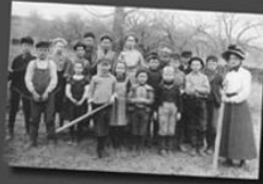
Clifford School 1904