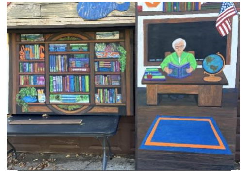
This mural depicting Shirley's life will be on a wall inside the she-shed.

Children love our unique Garden. Hundreds of little ones have visited our Garden since it was created ten years ago. More donations are needed to cover the rising cost of materials to maintain the Garden. Volunteers have been vital to that maintenance! A QR code will be added to the Garden to make donating quick and easy!